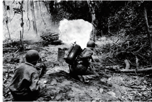
Fig. 1 An M1A1 flamethrower used by U.S. Army soldiers to clear a Japanese Bunker on Bougainville Island in March of 1944.