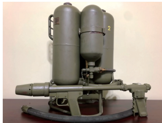
Fig. 2 The M2-2 man-portable flamethrower utilized by the U.S. military in the Pacific theater during the last 2 years of WWII.