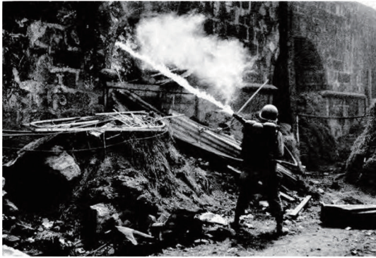
Fig. 5 A U.S. Army flamethrower operator fires his M2-2 into a wall opening in Manila, Luzon, February 1945.

Note the thin fire stream that indicates that napalm was added to the mixture.